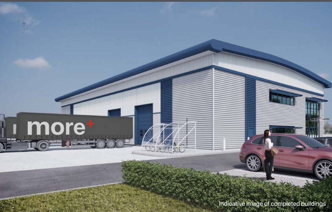
Indicative image of completed buildings

A brand new detached distribution unit with secure yard on the South West's Premier Distribution Park